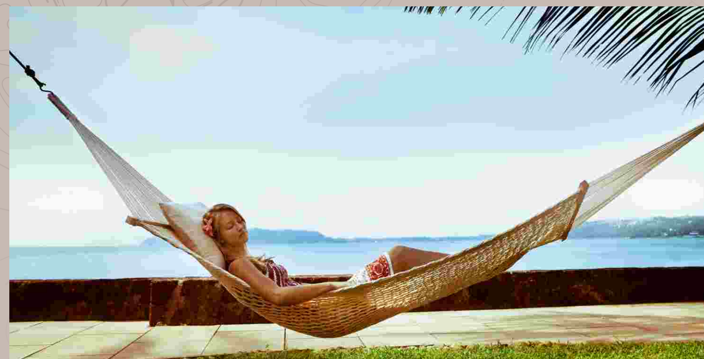
GOA MARRIOTT RESORT & SPA