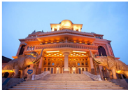
KINGDOM OF DREAMS