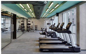
Re:charge SM gym